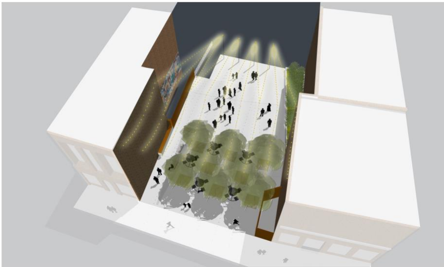
CLIFTON PLAZA LIGHTS