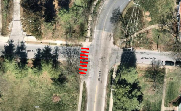
(b) Lafayette at Clifton