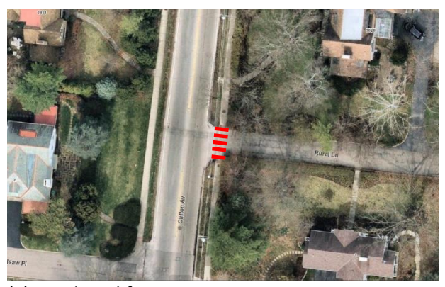
(g) Rural at Clifton