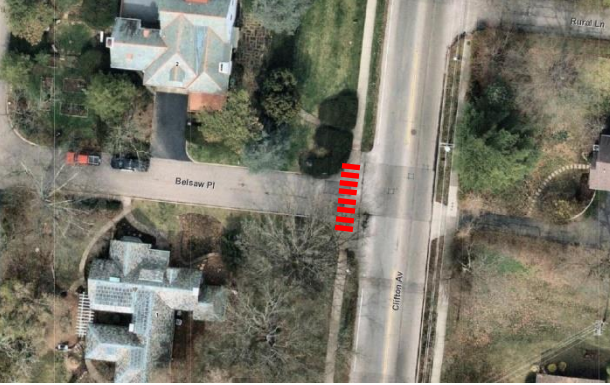
(d) Belsaw at Clifton