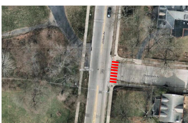
(h) Greendale at Clifton