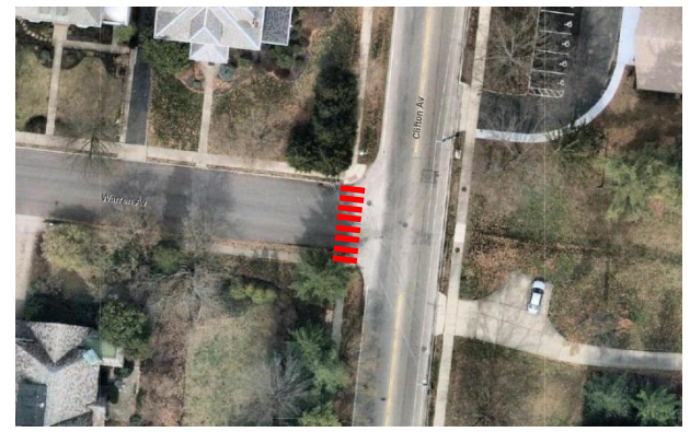
(e) Warren at Clifton