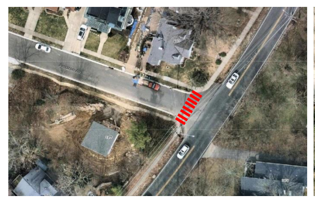
(a) Amazon at Clifton

Intended Results: Improve visibility of existing pedestrian crossings, improve pedestrian safety.