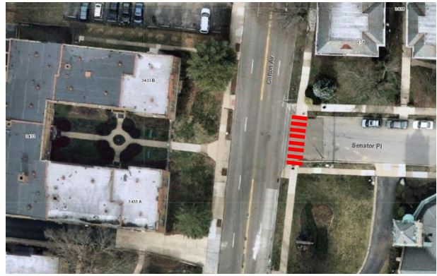
(i) Senator at Clifton