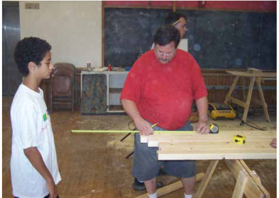
Art panel beginning