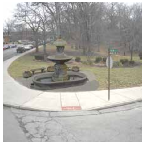
Fountain on Burnet