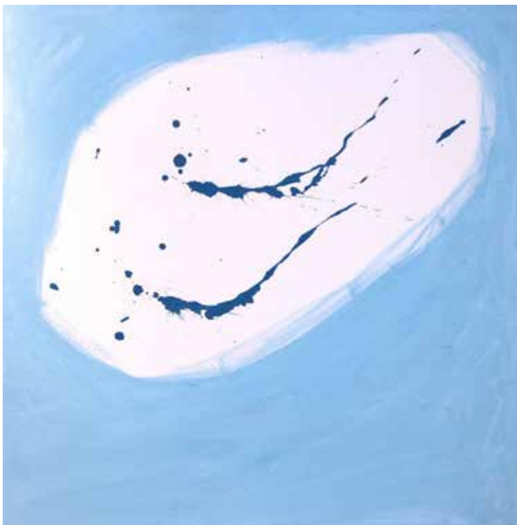
CCXXVII by Dick Waller

To view more of Dick Waller's work, visit www.dickwaller.com .