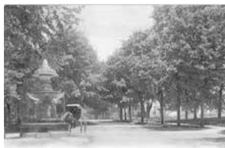
1887 - First Placement of the Probasco Fountain in a wider Clifton Avenue