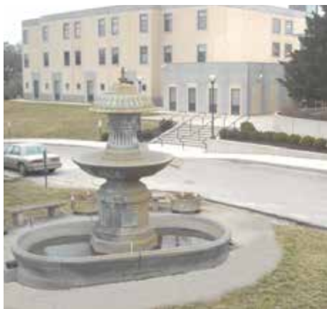
Fountain on Fairview