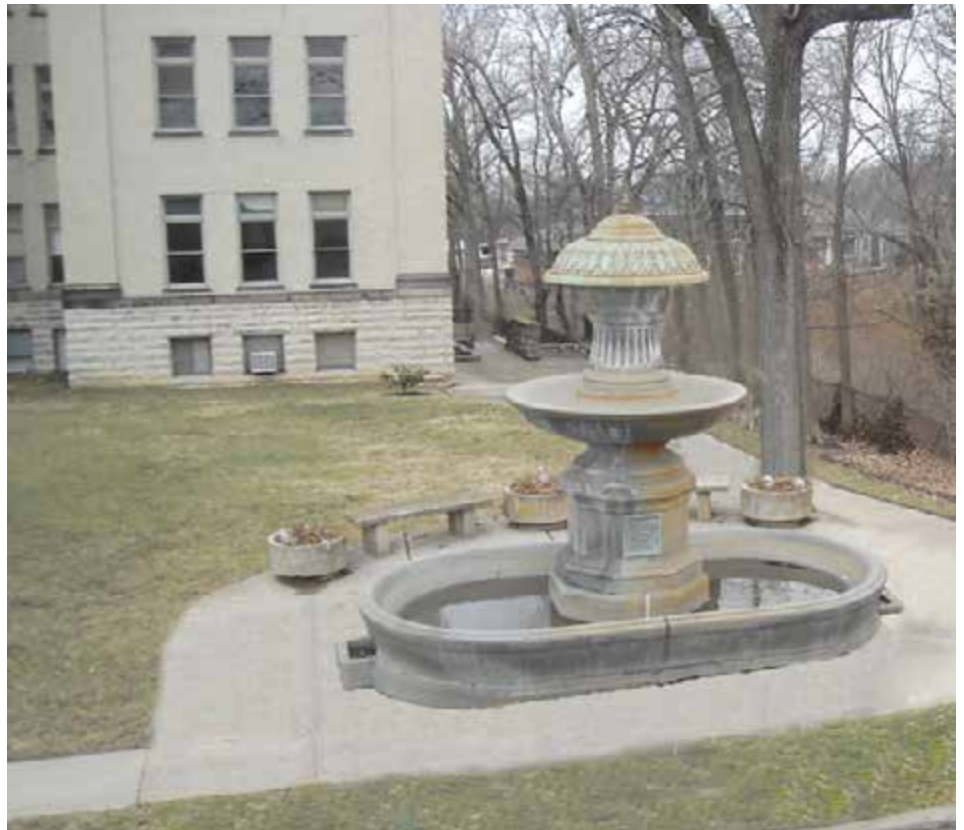
The Probasco Fountain could potentially be moved inward to the edge of the sidewalk on the curb of Clifton Avenue in front of the old Clifton School, now the location of the Clifton Cultural Arts Center. The tree would remain.

A community input session was held on February 19 at the Clifton Recreation Center. At the time of this