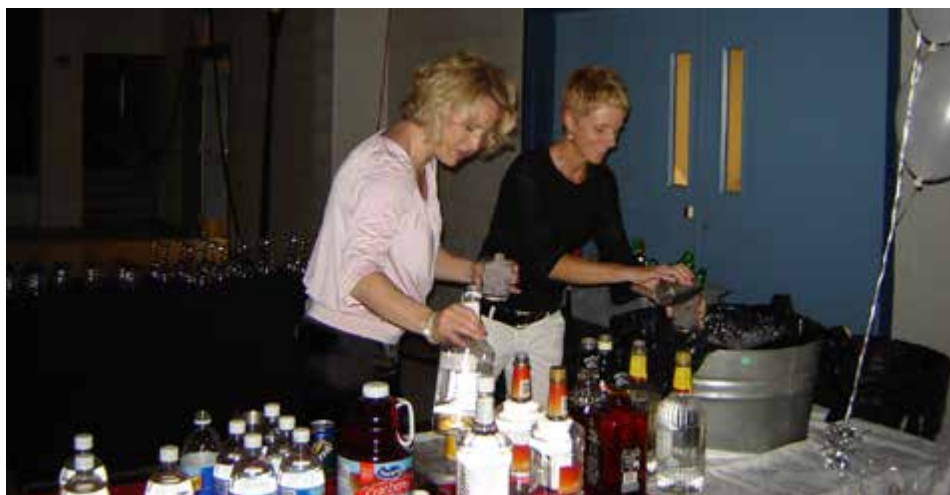
Attending the Gala is a great way to meet new people and enjoy good food and conversation.