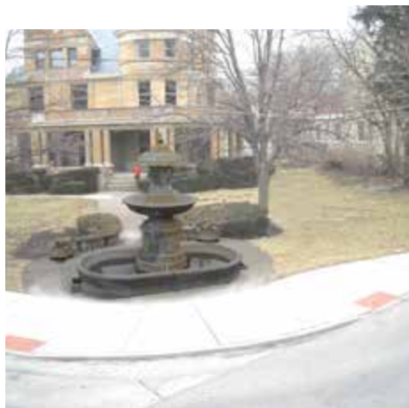
Fountain at the library