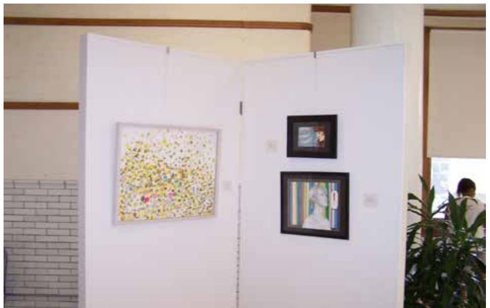
Completed art panel