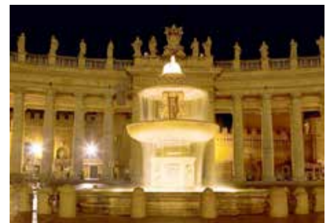
The 16th Century Fountains of St. Peter’s Square in Rome at the Vatican – design inspiration for the Probasco Fountain