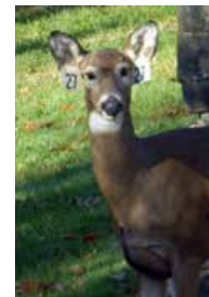
"Doe #27, sterilized in December 2015 and turning 8 years old this Spring, is one of the oldest does in our herd. She spends her days in and around Mt. Storm Park."

hypothermia. Hand warmers and space heaters at the outdoor command center helped keep the transport and recovery team volunteers from freezing!