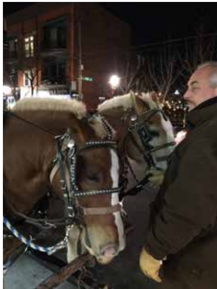
Beautiful & gentle beasts