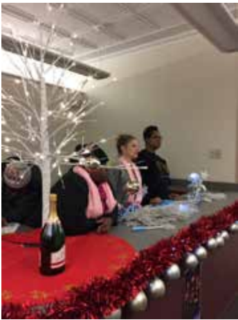
TriHealth volunteers giving out TriHealth donated light up wands