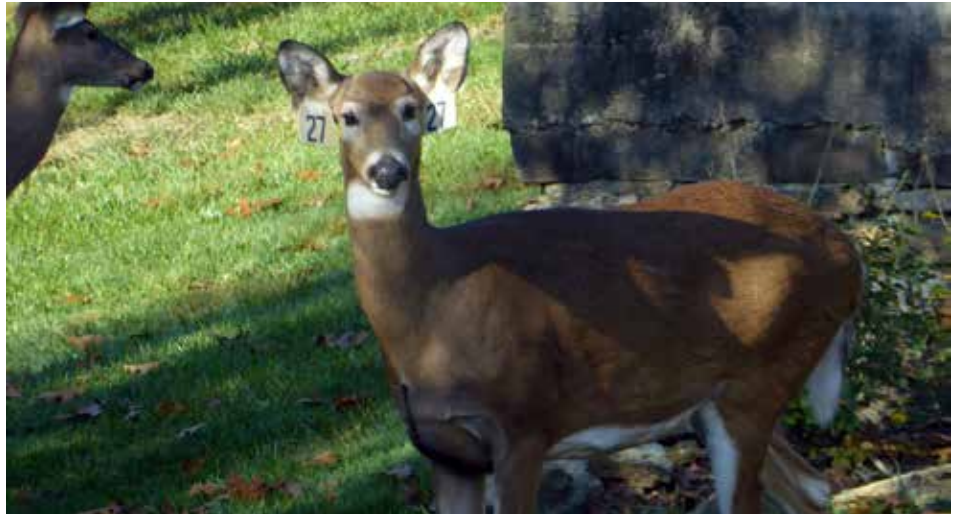
Doe #27, sterilized in December 2015 and turning 8 years old this Spring, is one of the oldest does in our herd. She spends her days in and around Mt. Storm Park with family members Doe #31 (aged 6.5) and Doe #52 (aged 3.5).

Last year the Discovery Channel produced a video documenting project field operations. This year, a French film company tagged along, interviewing and filming the White Buffalo team for an environmental documentary. They plan to broadcast the program in Germany and France sometime next year. We have been promised a copy