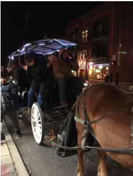
Lights on this year's carriage