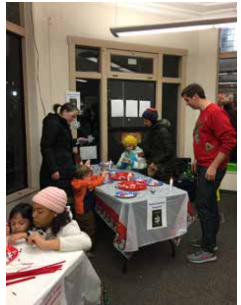
Kids get crafty