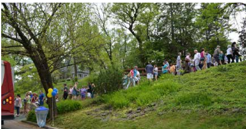
CTM's House Tour draws a crowd as the neighborhood displays beautiful homes and springtime flora.

Entrance tickets for all homes on the tour are $20 each for a pre-purchased ticket or $25 each when purchased on May 13. A beautiful house tour booklet with pictures and house biographies will be included with each ticket. Tickets can be purchased online at http://www.cliftoncommunity.org/clifton-house-tour-2018/ or at selected businesses in the Business District.