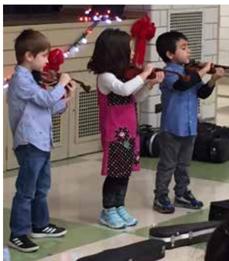
In December 2017, CANS staged both a Holiday Concert and a Cookie Party

Visit our website for FAQs and much more at https://www.canselementary.org/faq/