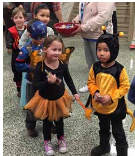
CANS Literary Parade, Halloween 2017, at Rising Stars Academy on Vine