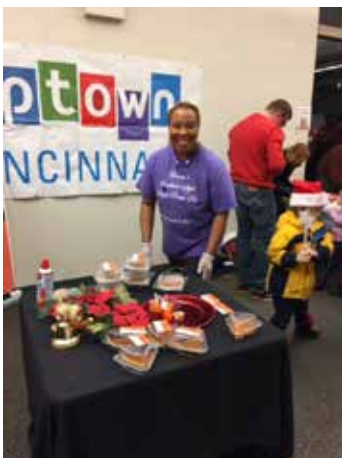
Bonita's Sweet Potato Pies